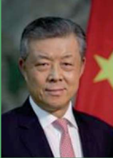
中国驻英国大使刘晓明 H.E. LIU Xiaoming Chinese Ambassador to the UK