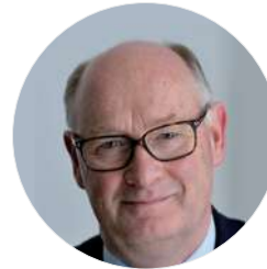
Sir Douglas Flint CBE

Chairman of the CCCUK; General Manager of Bank of China London Branch; Chief Executive Officer of Bank of China (UK) Limited