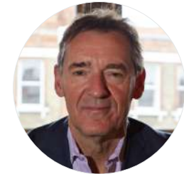
Lord Jim O'Neill

Former Commercial Secretary to the Treasury; Chair of Chatham House