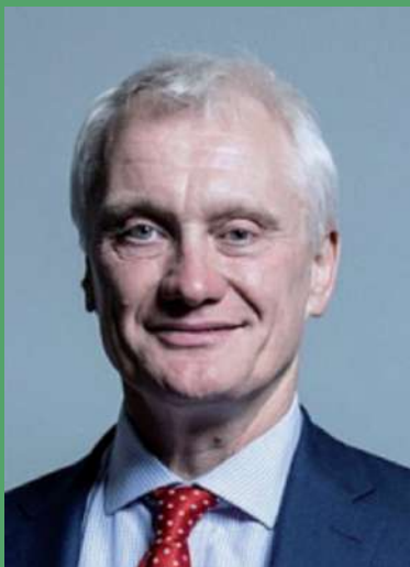
英国国际贸易部投资部长格拉汉姆·斯图尔特 Graham Stuart MP Minister for Investment, Department for International Trade